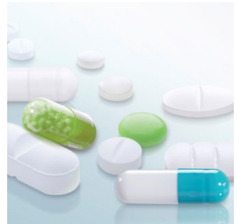
Complex solid dosage forms