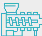
Hot melt extrusion